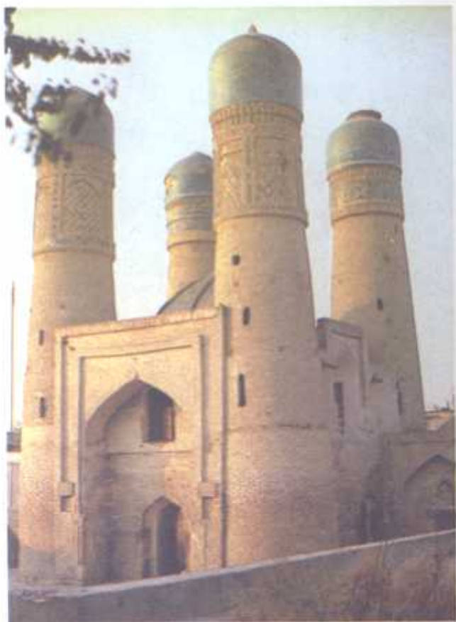
Bukhara . Chor Minor Minaret. 19 th c.